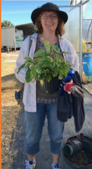
An awe-inspiring BBG volunteer!